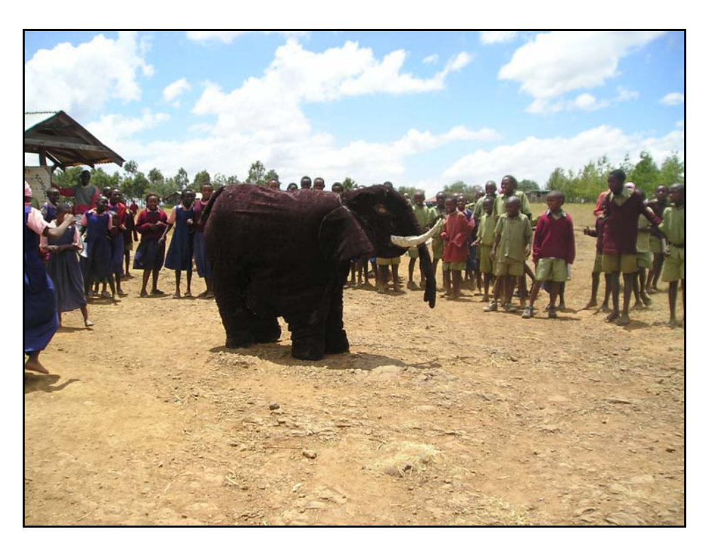
Fig. 4 Human-elephant conflict play performed at a school in south-west Laikipia