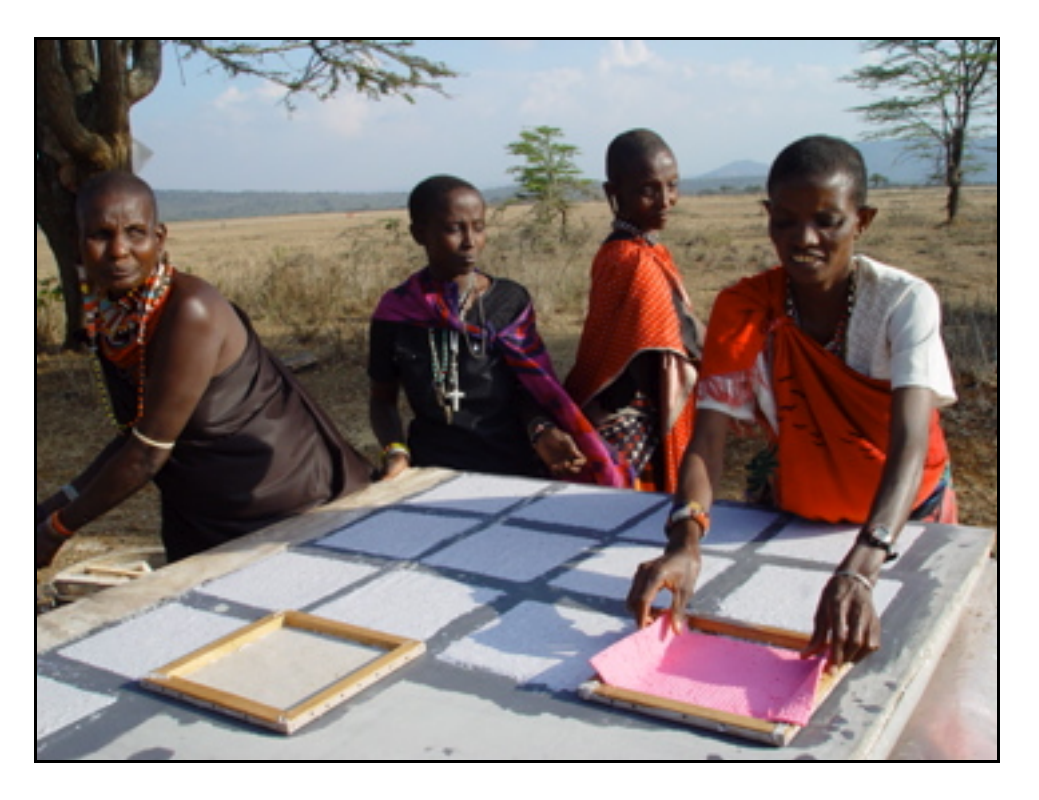
Fig. 4 Mukogodo Elephant Women making elephant dung paper