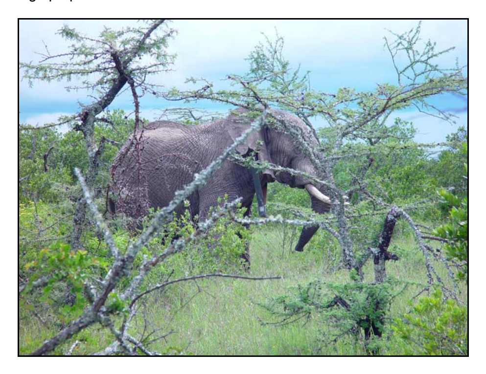
Fig. 3 Crop-raiding bull fitted with a GPS/GSM collar in Laikipia

The following activities have been undertaken: GPS/GSM collars ordered, two deployed on known crop-raiding elephants; design of text message warning discussed with Save the Elephants; GPS surveys of property boundaries to be used in the system (i.e. the boundaries that if crossed by problem elephants will trigger text message alarms to designated rapid response teams). Elephant tracking software is currently under construction though is due to be released within the next two weeks. A form has been designed for the collection of data relating to the responses of designated teams to text message warnings on a private conservancy. This form is being trialed in April/May of this year with OI Pejeta Conservancy where one of the collared problem elephants spends a high proportion of his time.